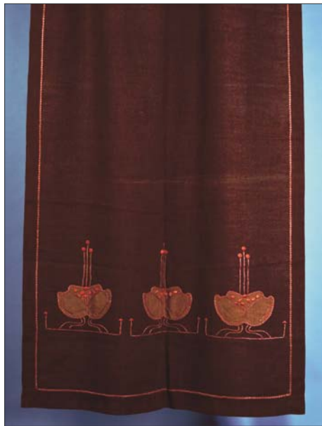
Portière, c. 1910; No. 908, Lotus design; Craftsman canvas and appliquéd linen; Gustav Stickley; from the collection of The Charles Hosmer Morse Museum of American Art, Winter Park, FL

Catalogues from the period describe the standard sizes for curtains as 54, 72, or 81 inches long, and portières as 108 inches long. The Morse's curtain panels appear to have been custom sized or altered because two measured 77 inches and the third 90 inches in length. Measurements of all the windows and door frames were then taken at Osceola Lodge to narrow down the spaces that might fit these specific dimensions.