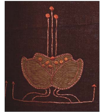
Detail of portière.

Though the portières in these rooms appear to be similar in size, texture and color, they were clearly not the Craftsman panels that were discovered; perhaps the panels had been lined, or, more likely given their pristine condition, even rejected and replaced by the simplified versions seen in the photographs. In either case, these portières from Osceola Lodge remained providentially stored until our happy discovery.