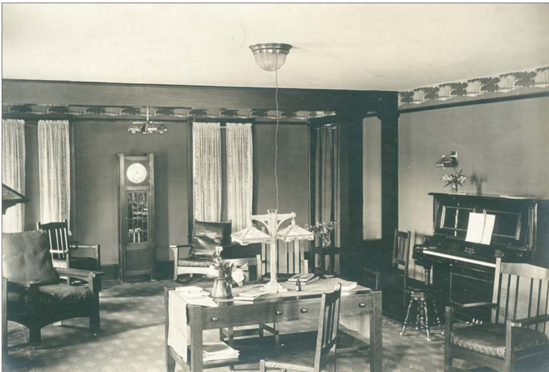
Interior of the Osceola Lodge living room, c. 1915.

as "strong and assertive...in order to meet the demands of the position in which they are placed." Design themes for the textile lines paid homage to nature and included peacock, seedpod, ginkgo, pinecone, apple, tulip, checkerberry, and lotus motifs. The pattern on the Morse's curtains is described in The Craftsman as "the oldest of all floral patterns, the lotus, although it here appears in an obscure and 'simplified' form." Conventionalizing, or providing an "interpretation of simple plant forms," was typical of the decoration on Arts and